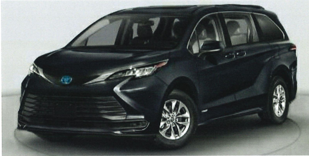
Note: Photo may not represent exact vehicle or selected equipment.

Vehicle: [Fleet] 2025 Toyota Sienna (5402) LE FWD 8-Passenger (SE) (✔ Complete)